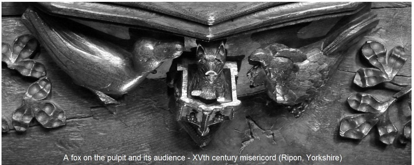
A fox on the pulpit and its audience - XVth century misericord (Ripon, Yorkshire)